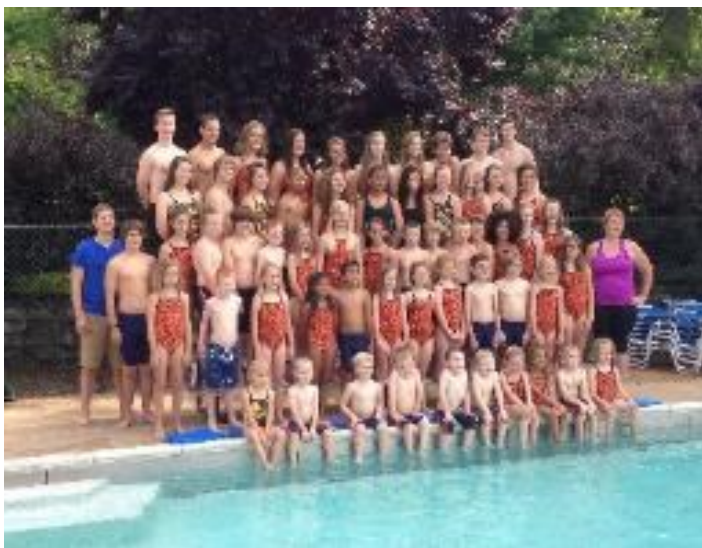
ABOVE: CLWII The Waves 2013 team picture. Can you spot your favorite swimmer?