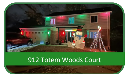
912 Totem Woods Court