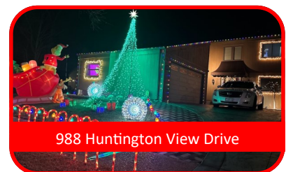
988 Huntington View Drive

Congratulations to the five Holiday Lights Decoration Contest winners! Thank you to all who make the holiday season brighter!