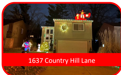
1637 Country Hill Lane

Congratulations to the five Holiday Lights Decoration Contest winners! Thank you to all who make the holiday season brighter!