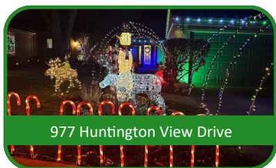
977 Huntington View Drive