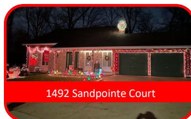
1492 Sandpointe Court